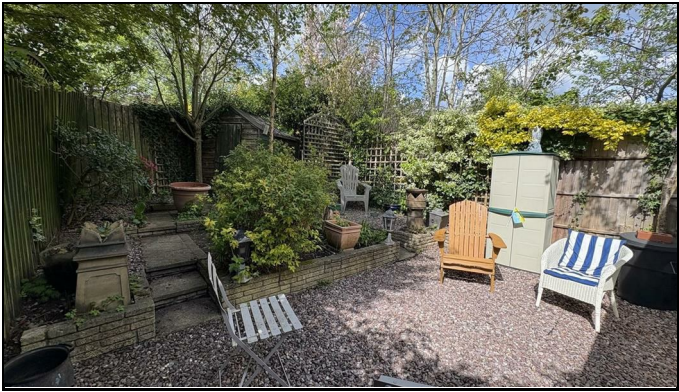
Duke Street, Sutton Coldfield