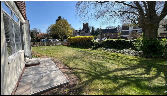
Stratford Court, Maney Hill Road, Sutton Coldfield