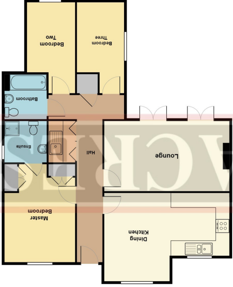
Browns Drive, Sutton Coldfield, B73 5RN

THIS PLAN IS NOT TO SCALE AND IS GIVEN TO PROVIDE A GENERAL GUIDE. IT MERELY INDICATES APPROXIMATE RELATIONSHIP OF ONE ROOM TO ANOTHER.