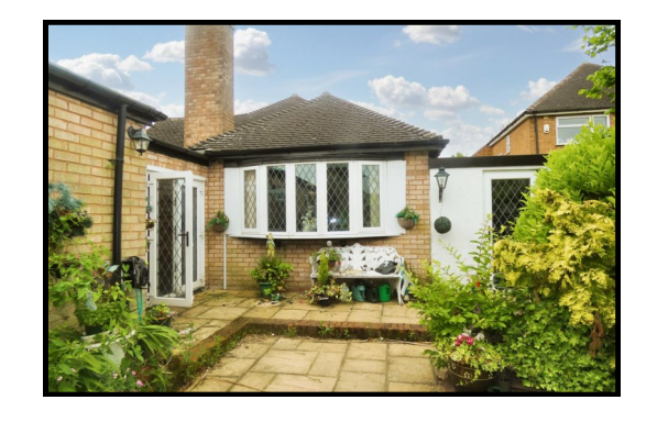
3 Braemar road, Sutton Coldfield, B73 6LN~ Offers around £550,000