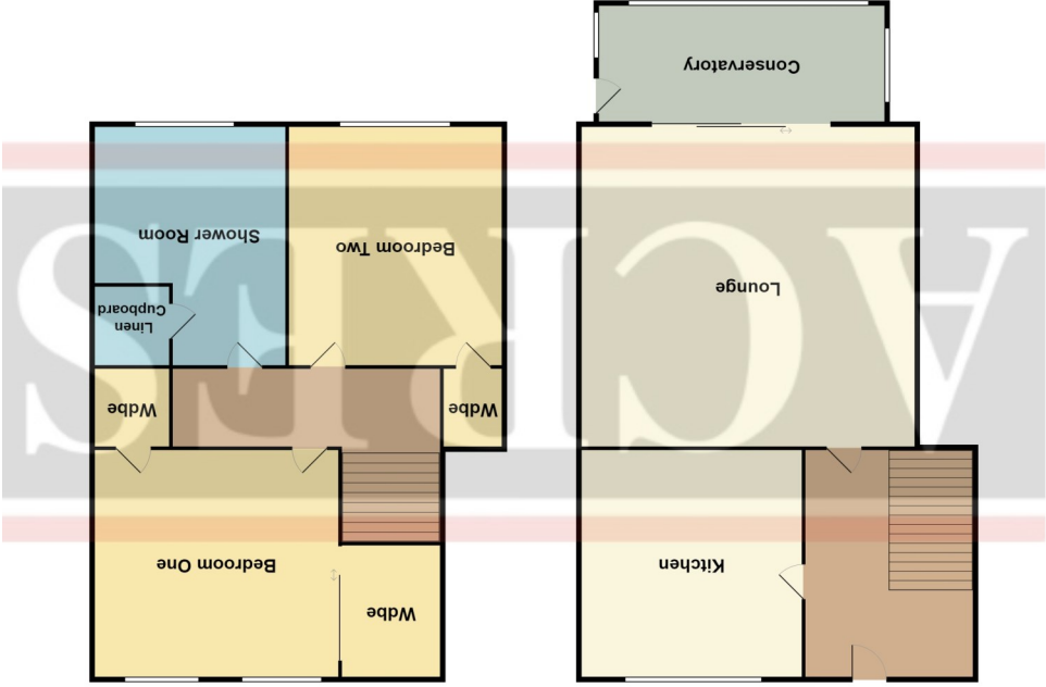
THIS PLAN IS NOT TO SCALE AND IS GIVEN TO PROVIDE A GENERAL GUIDE. IT MERELY INDICATES APPROXIMATE RELATIONSHIP OF ONE ROOM TO ANOTHER.

We have been informed by the vendors that the property is Freehold. Please note that the details of the tenure should be confirmed by any prospective purchaser's solicitor.) As per sales particulars. Recommended via Acres on 0121 321 2101.