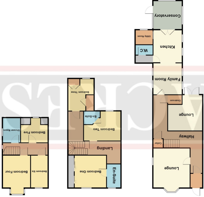
THIS PLAN IS NOT TO SCALE AND IS GIVEN TO PROVIDE A GENERAL GUIDE. IT MERELY INDICATES APPROXIMATE RELATIONSHIP OF ONE ROOM TO ANOTHER.

We have been informed by the vendors that the property is Freehold. Please note that the details of the tenure should be confirmed by any prospective purchaser's solicitor.) As per sales particulars. Recommended via Acres on 0121 321 2101.