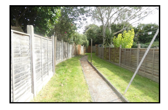
19 Court Lane, Erdington, B23 6NS ~ Offers around £190,000