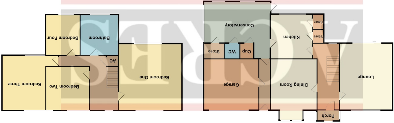
THIS PLAN IS NOT TO SCALE AND IS GIVEN TO PROVIDE A GENERAL GUIDE. IT MERELY INDICATES APPROXIMATE RELATIONSHIP OF ONE ROOM TO ANOTHER.

We have been informed by the vendors that the property is Freehold. Please note that the details of the tenure should be confirmed by any prospective purchaser's solicitor.)