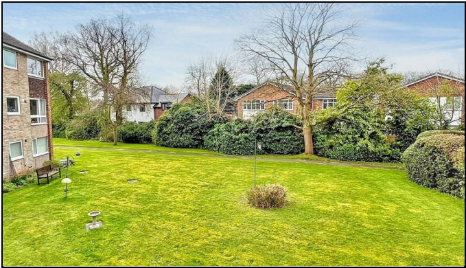
Eldon Drive, Sutton Coldfield, B76 1LT