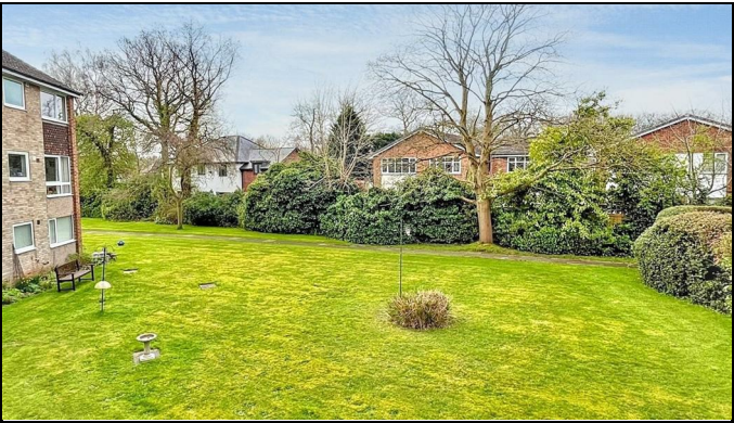
Eldon Drive, Sutton Coldfield, B76 1LT