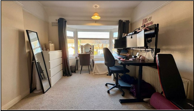
Holly Lane, Erdington, B24 9LA