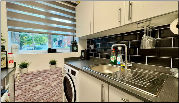
Newhall Farm Close, Sutton Coldfield, B76 1BQ