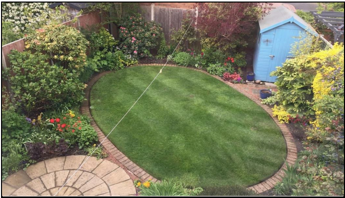
Chater Drive, Sutton Coldfield, B76 2BJ