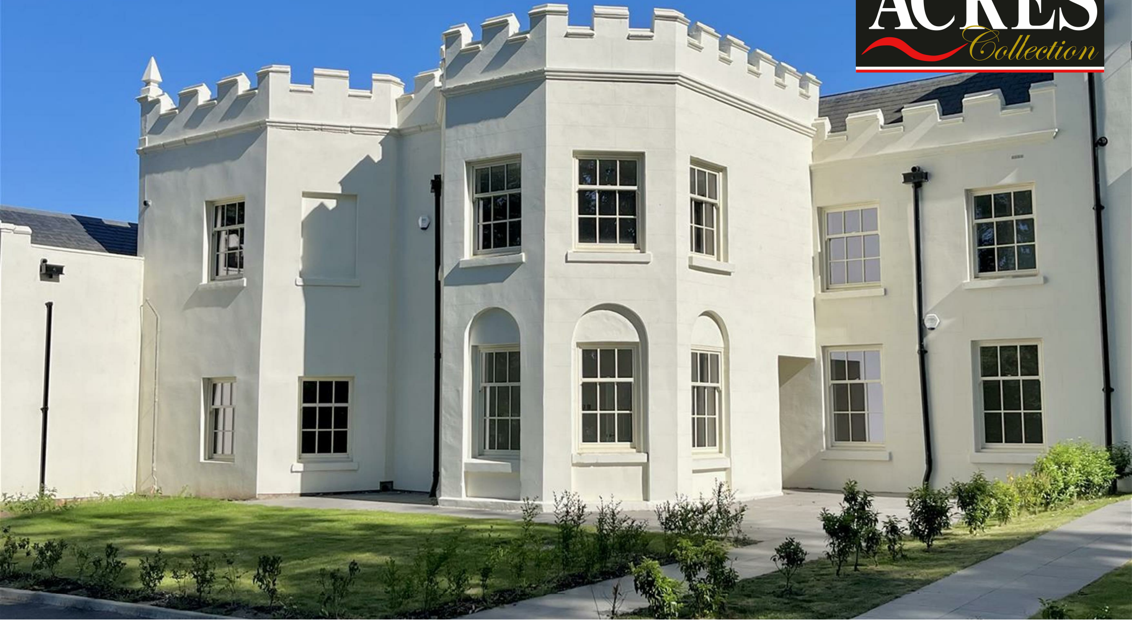
PACKINGTON HALL/MEWS, PACKINGTON, WS14 9HJ £580,000