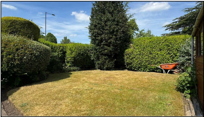
Redcroft Drive, B24 0EG