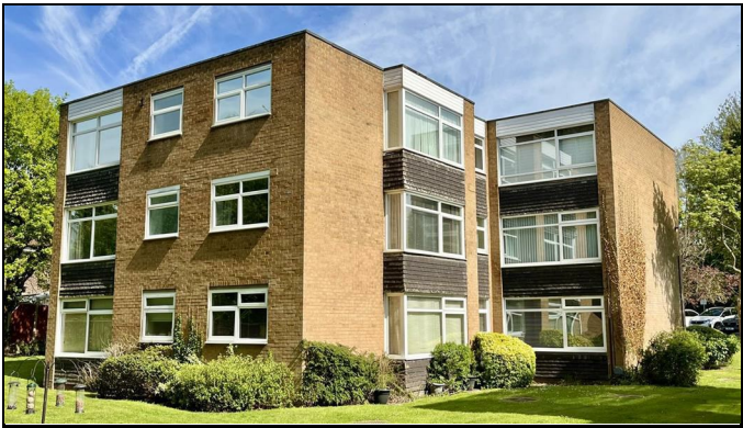
Trident Close, Sutton Coldfield, B76 1LF