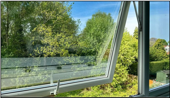
Trident Close, Sutton Coldfield, B76 1LF