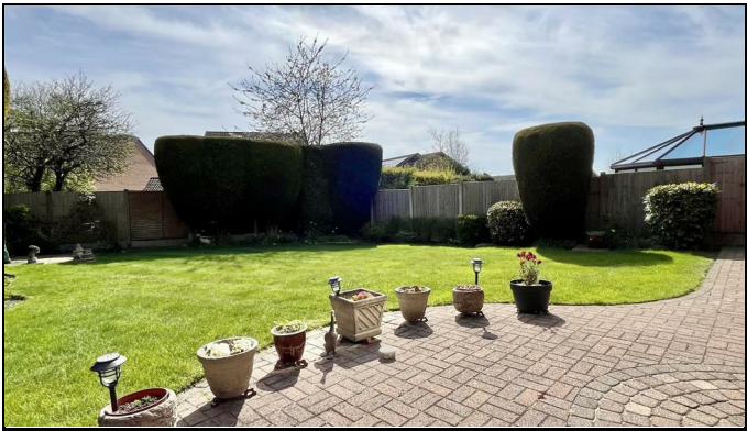
Malvern Drive, Sutton Coldfield, B76 1PZ