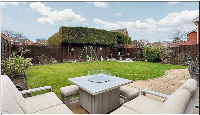
Brookhus Farm Road, Sutton Coldfield, B76 1QP