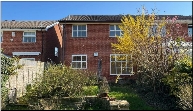
Old Fordrove, Sutton Coldfield, B76 1AQ