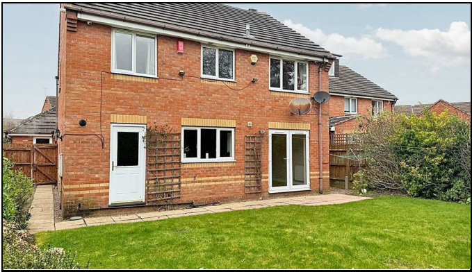
Warren House Walk, Sutton Coldfield, B76 1TS