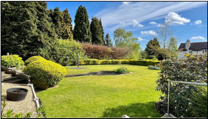
Riland Court, Penns Lane, B72 1AY