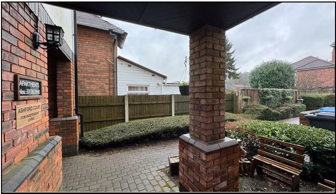
Ashford Court, Sutton Coldfield, B76 1QN