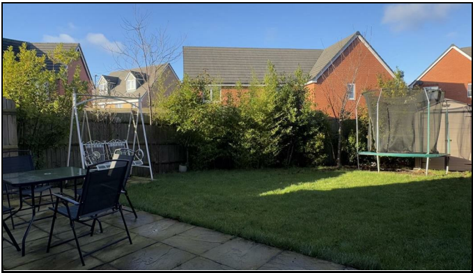
Horsfall Drive, Sutton Coldfield, B76 2BT