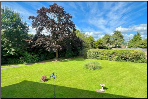
Eldon Drive, Sutton Coldfield, B76 1LT

TENURE: COUNCIL TAX BAND: FIXTURES & FITTINGS: VIEWING: We have been informed by the vendors that the property is Leasehold. (Please note that the details of the tenure should be confirmed by any prospective purchaser's solicitor) B As per sales details. Recommended via Acres on 0121 313 2888