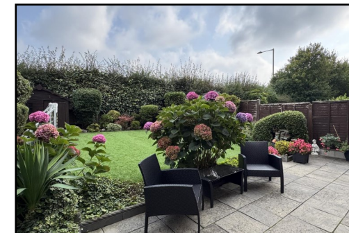
Moat Croft, Sutton Coldfield, B76 1GD