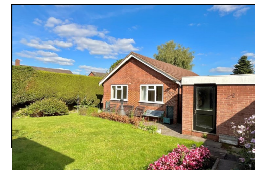
Beverley Close, Sutton Coldfield, B72 1YF

TENURE: We have been informed by the vendors that the property is Freehold. (Please note that the details of the tenure should be confirmed by any prospective purchaser's solicitor) COUNCIL TAX BAND: E FIXTURES & FITTINGS: As per sales details. VIEWING: Recommended via Acres on 0121 313 2888