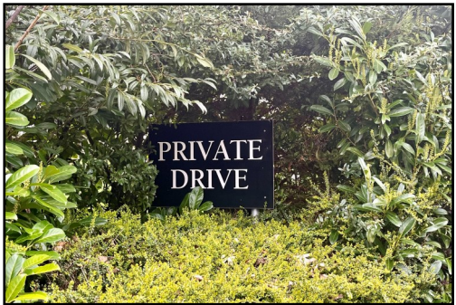
The Fairways, Sutton Coldfield, B76 1FZ

TENURE: COUNCIL TAX BAND: FIXTURES & FITTINGS: VIEWING: We have been informed by the vendors that the property is Freehold. (Please note that the details of the tenure should be confirmed by any prospective purchaser's solicitor) E As per sales details. Recommended via Acres on 0121 313 2888