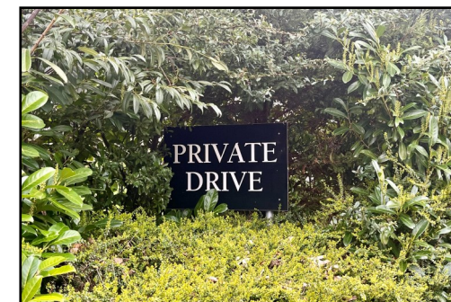
The Fairways, Sutton Coldfield, B76 1FZ

TENURE: We have been informed by the vendors that the property is Freehold. (Please note that the details of the tenure should be confirmed by any prospective purchaser's solicitor) COUNCIL TAX BAND: E FIXTURES & FITTINGS: As per sales details. VIEWING: Recommended via Acres on 0121 313 2888