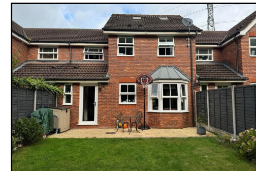
Hollingberry Lane, Sutton Coldfield, B76 1SP