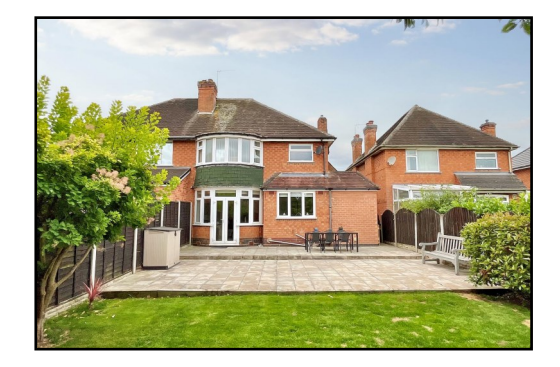
Beeches Drive, B24 0DT

VIEWING: Recommended via Acres on 0121 313 2888