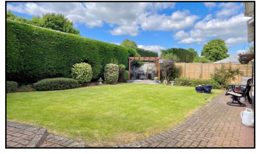
33 NEWMARSH ROAD, WALMLEY, B76 1XP ~ Offers in Excess of £550,000