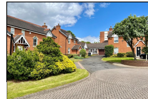
Peveril Grove, Sutton Coldfield, B76 1FR

TENURE: We have been informed by the vendors that the property is Freehold. (Please note that the details of the tenure should be confirmed by any prospective purchaser's solicitor) COUNCIL TAX BAND: E FIXTURES & FITTINGS: As per sales details. VIEWING: Recommended via Acres on 0121 313 2888