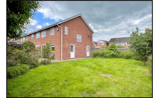
Oversley Road, Sutton Coldfield, B76 1XA