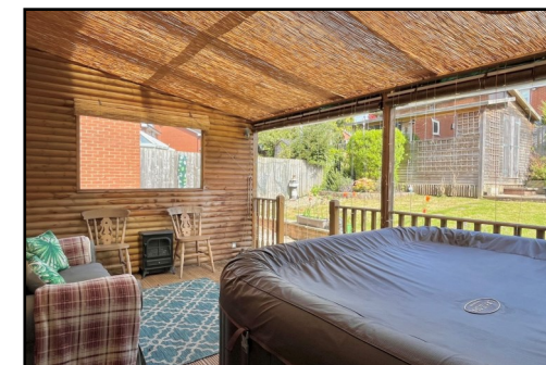
Dickinson Drive, Sutton Coldfield, B76 1FP

TENURE: We have been informed by the vendors that the property is Freehold. (Please note that the details of the tenure should be confirmed by any prospective purchaser's solicitor) COUNCIL TAX BAND: E FIXTURES & FITTINGS: As per sales details.