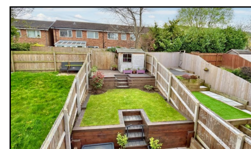
28 CAMPION GARDENS, ERDINGTON, B24 OHF ~ Offers in Region of £250,000