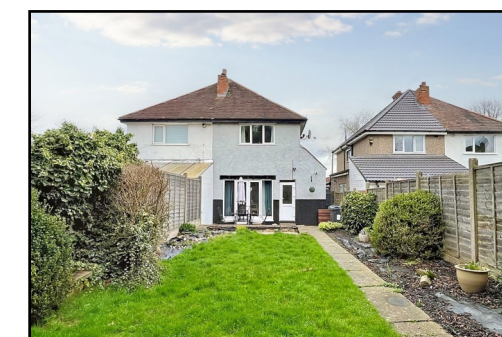
Elmfield Avenue, B24 0QF