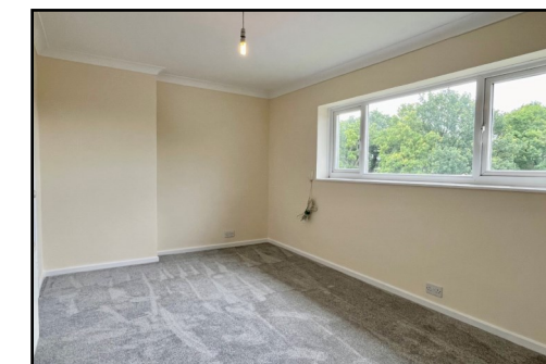
Penns Court, Walmley, B76 1DL