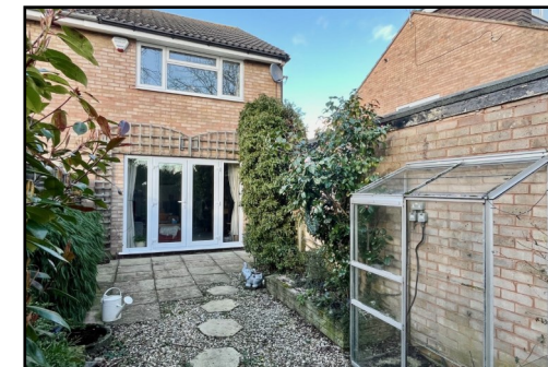
Brailles Drive, Sutton Coldfield, B76 2UW

TENURE: We have been informed by the vendors that the property is Freehold. (Please note that the details of the tenure should be confirmed by any prospective purchaser's solicitor) COUNCIL TAX BAND: C FIXTURES & FITTINGS: As per sales details. VIEWING: Recommended via Acres on 0121 313 2888