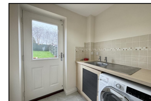
Campion Gardens, B24 0HF