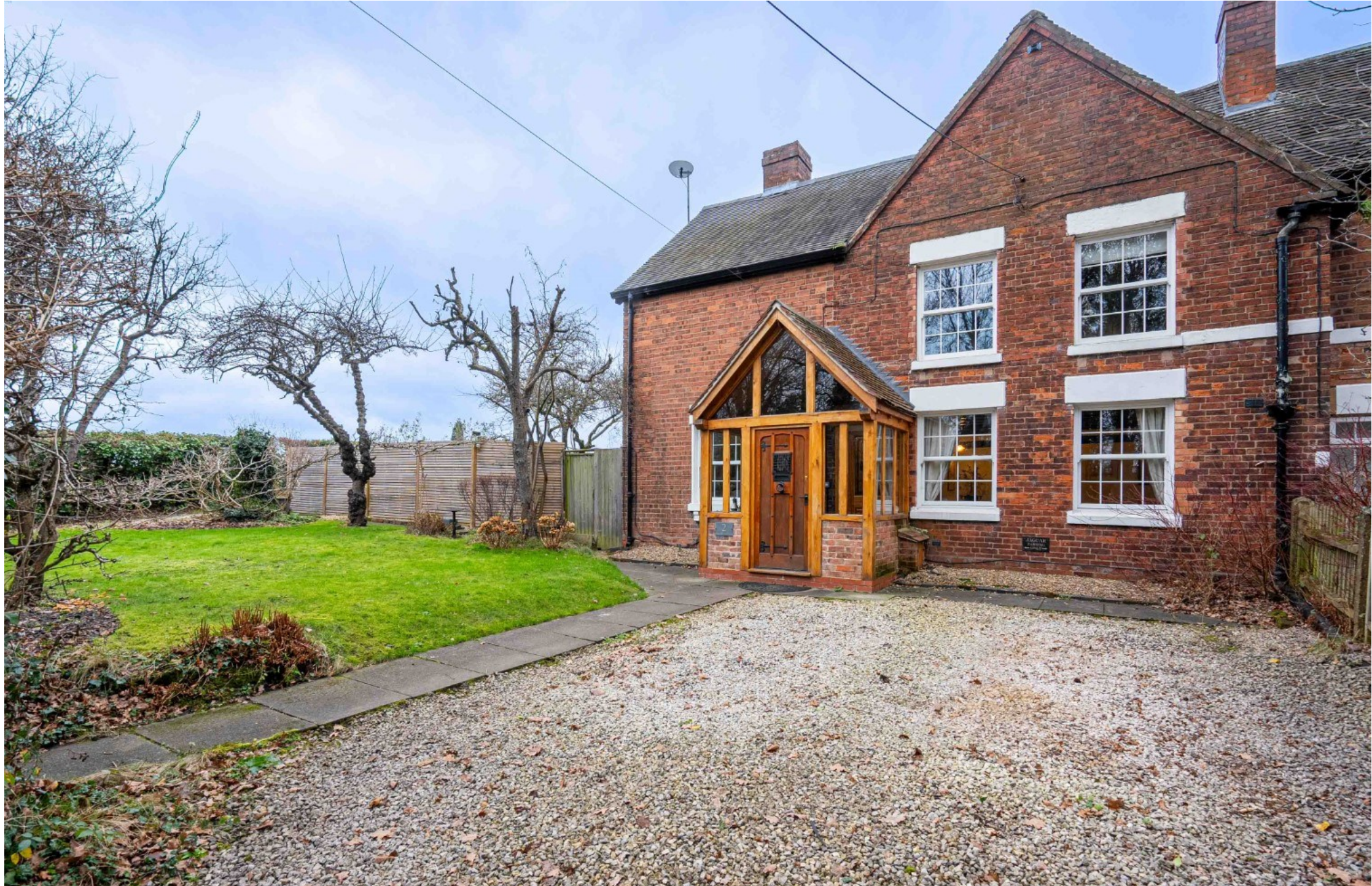
2, YEW TREE COTTAGES, WALMLEY ASH LANE, B76 2AA