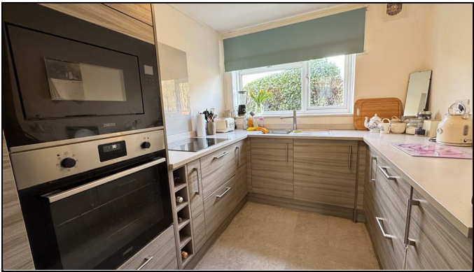
23 Woburn Crescent, Great Barr, B43 6AX