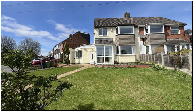
Gainsborough Crescent, Great Barr, B43 7LB