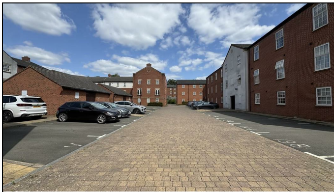
142 Horseshoe Crescent, Great Barr, B43 7BL