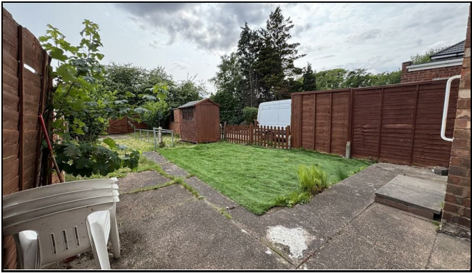
398 Rocky Lane, Great Barr, B42 1NH