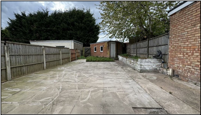
156 Elmbridge Road, Birmingham, B44 8AE