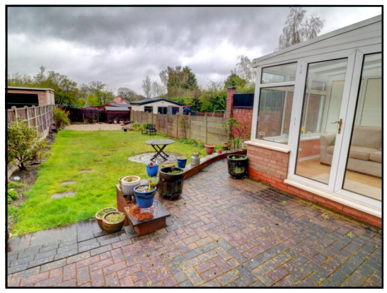
329 Birmingham Road, Great Barr, B43 7AP - Offers in excess of £375,000