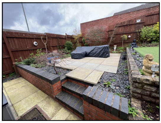
19 Croyde Avenue, Birmingham, B42 1JB - Offers in the region of £325,000