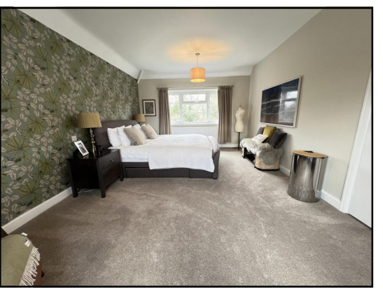
18 Fairyfield Avenue, Great Barr, B43 6AG - Offers in excess of £650,000