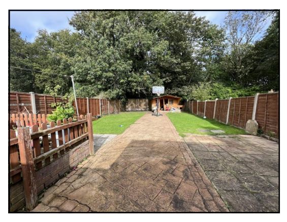
Coronation Road, Great Barr B43 7AU - Offers in the region of £375,000